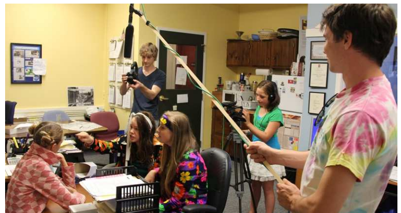
Right: Behind the scenes during an action shot for this year's summer camp video.

During this year's week-long "Young Broadcasters" Video Camp, 14 campers aged 9-13 brainstormed and created their own commercials, PSAs, interviews and parodies, while learning camera skills, video editing, working with sound and video effects, and green screening. They premiered their video, "Return to the Rise of Planet of the Clams," before a packed house of parents and fans.