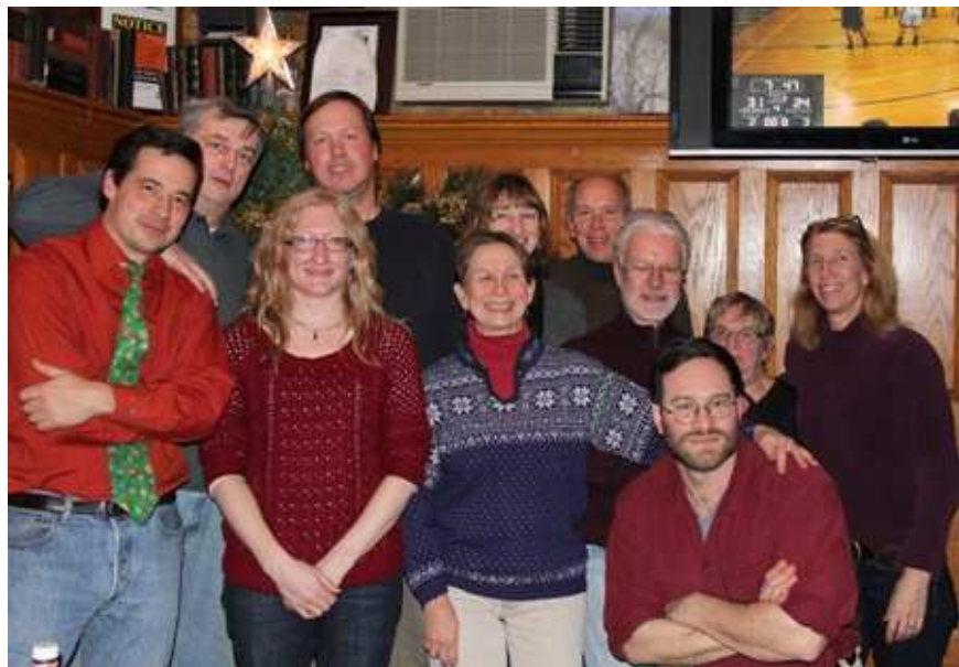
Above: Board and staff members celebrate the holidays while BUHS-TV broadcasts a basketball game live on BCTV (upper right).